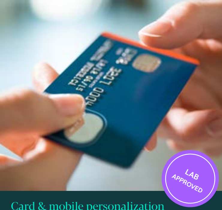
Card & mobile personalization validation testing services.