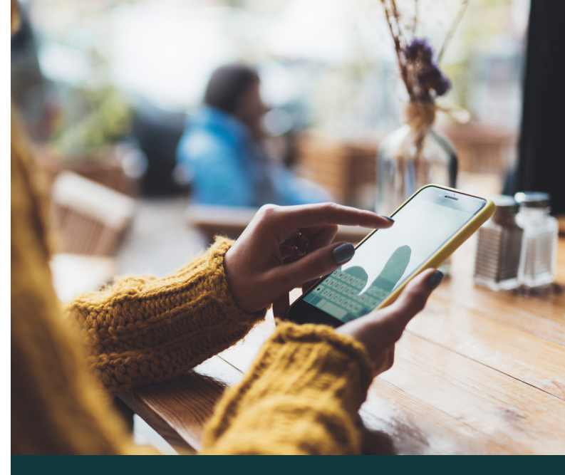
Remote card profile testing tool.

Test and verify SIM, UICC and enabled eUICC profiles remotely.