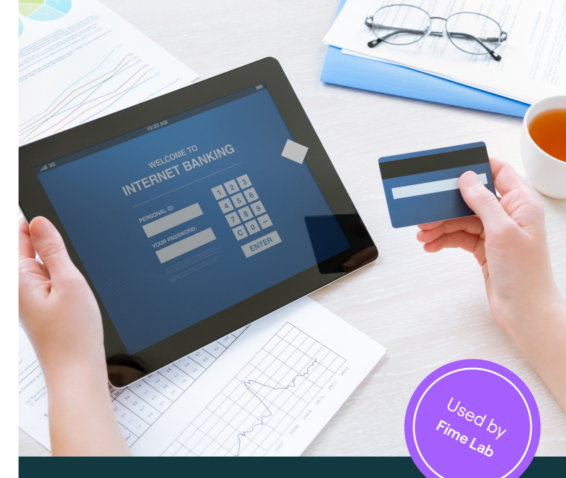
Enabling a safe and interoperable open API framework.