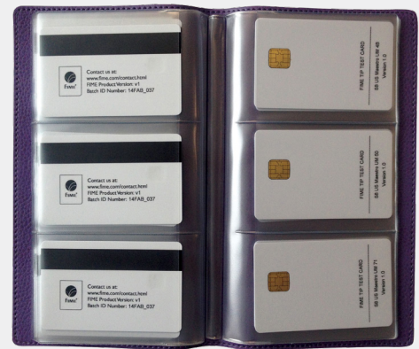
Card book for convenient and safe storage